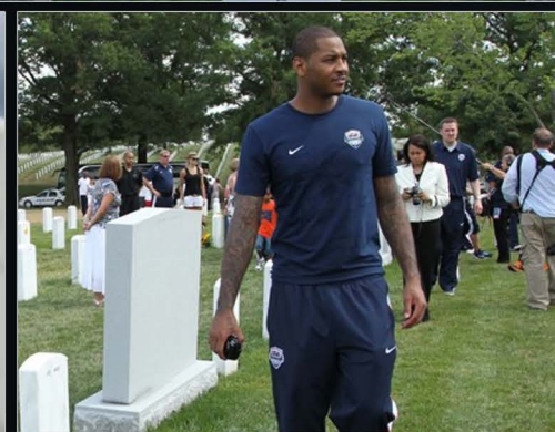
General Martin Dempsey walked the team through Arlington National Cemetery